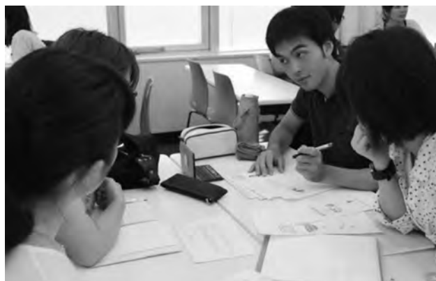
Figure 1. English workshop to refine presentations